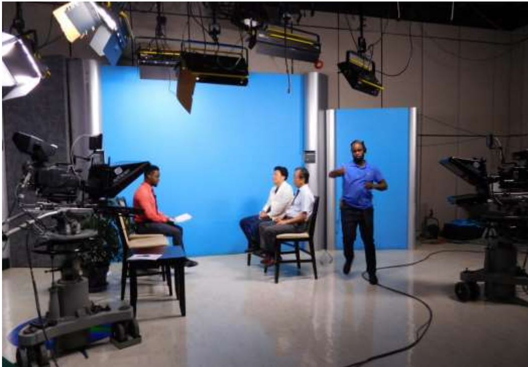
On set at CBC for a live interview on Morning Barbados (2017/09/04)