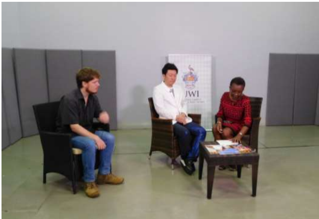
At UWI Cave Hill campus for an interview on UWI TV (2017/09/05)